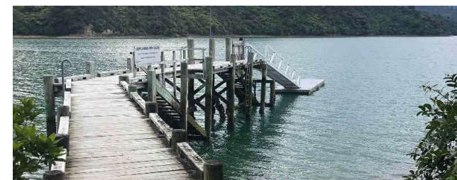
Floating Jetty and car park at Te Mahia