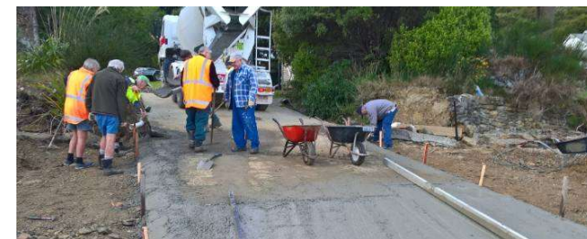
Public boat ramp at Portage