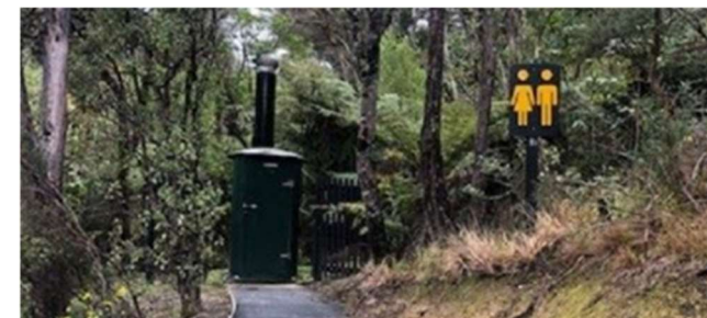
New public toilets at Torea Bay